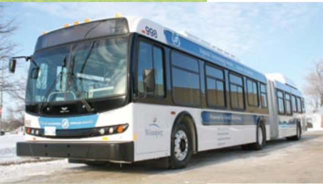
The Province of Manitoba is providing funding for 20 New Flyer hybrid-electric buses to add to Winnipeg Transit's fleet.