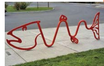
Examples of art bike racks