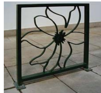
Examples of art bike racks