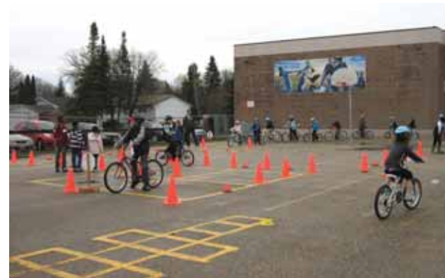
▲ Children participating in MPI Bike Rodeo learn basic cycling skills.