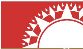
HEADINGLEY GRAND TRUNK TRAIL