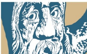
SENTIERS BOIS-DES-ESPRITS TRAIL