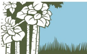
BISHOP GRANDIN GREENWAY TRAIL